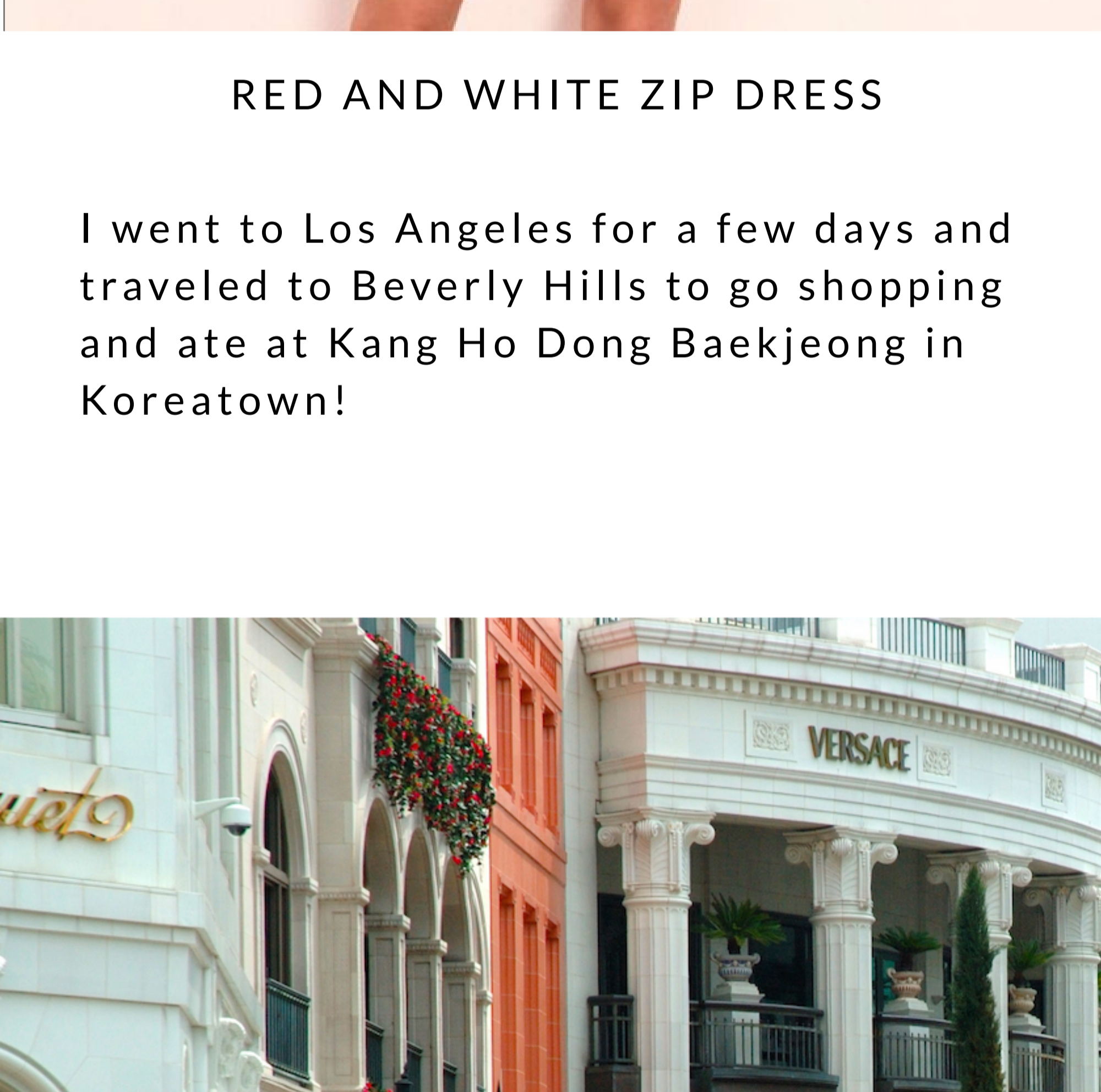
RED AND WHITE ZIP DRESS

I went to Los Angeles for a few days and traveled to Beverly Hills to go shopping and ate at Kang Ho Dong Baekjeong in Koreatown!